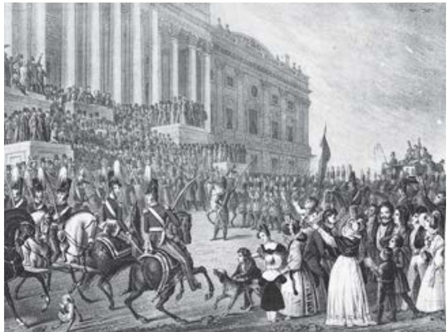
The inauguration of William Henry Harrison in March of 1841.